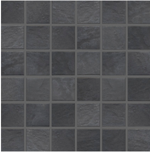
Black R10/B 42200H