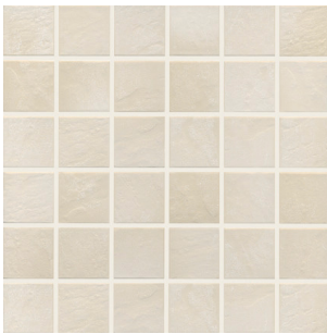
Beige R10/B 42204H