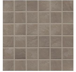
Mud R10/B 42203H