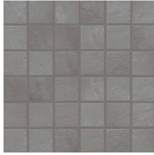
Medium Grey R10/B 42201H